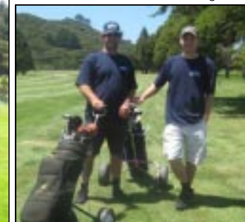
Half Placemakers Team - Rest lost on fairway