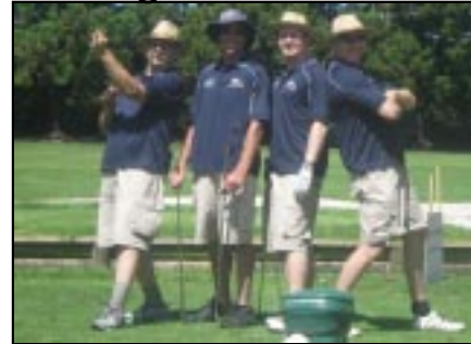
Team KKK School