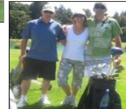
Tiouka Estate Olive Oil - a well oiled Team